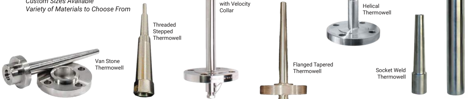
Threaded Stepped Thermowell

Custom Sizes Available Variety of Materials to Choose From